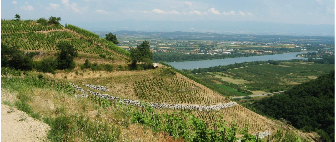
Old-vines of Syrah in monopole Les Côtes Saint-Joseph