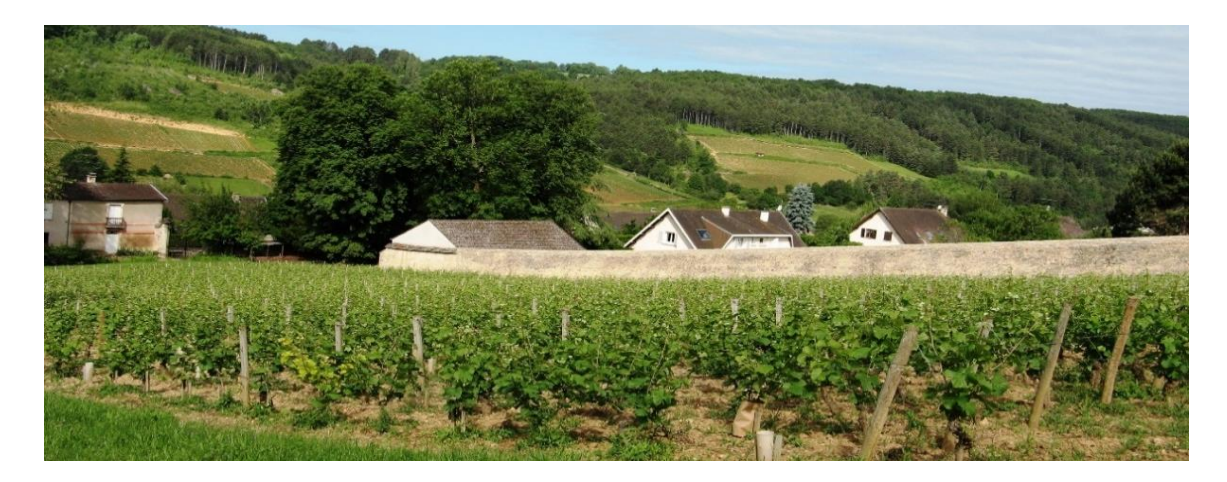
Dubreuil-Fontaine's historic monopole "Clos Berthet" Organically farmed old vines of Chardonnay and Pinot Noir.