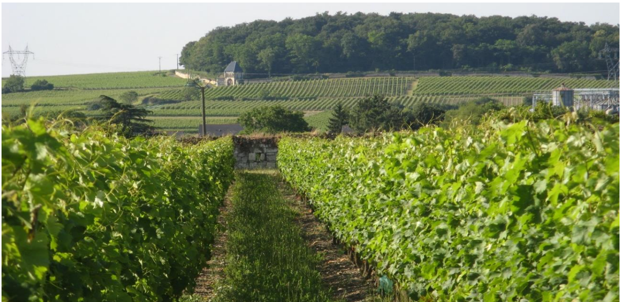
Standing within the Loups Noir vineyard