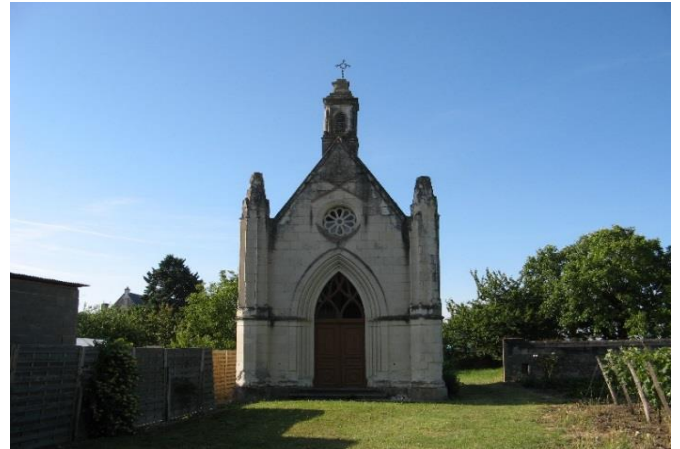
The chapel within Clos Chatains