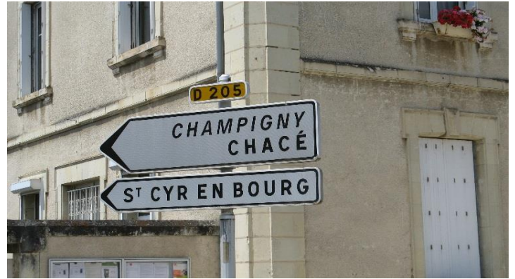
Entering the village of St-Cyr-en-Bourg