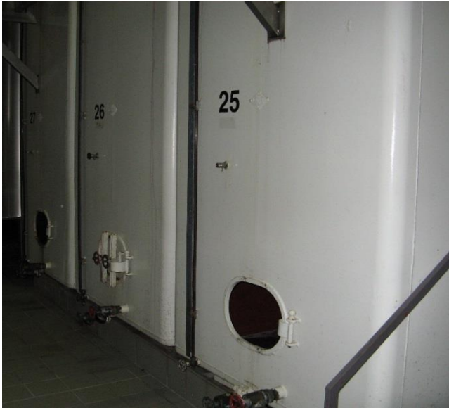
Nerleux's enamel fermenting vats