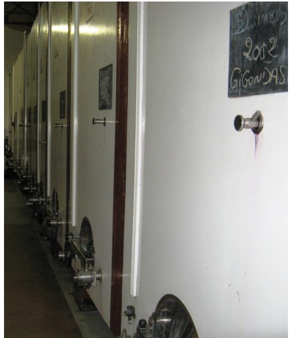
Same cement vats used since 1981