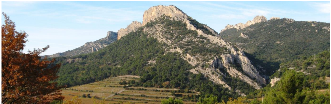
In the shadow of Dentelles de Montmirail