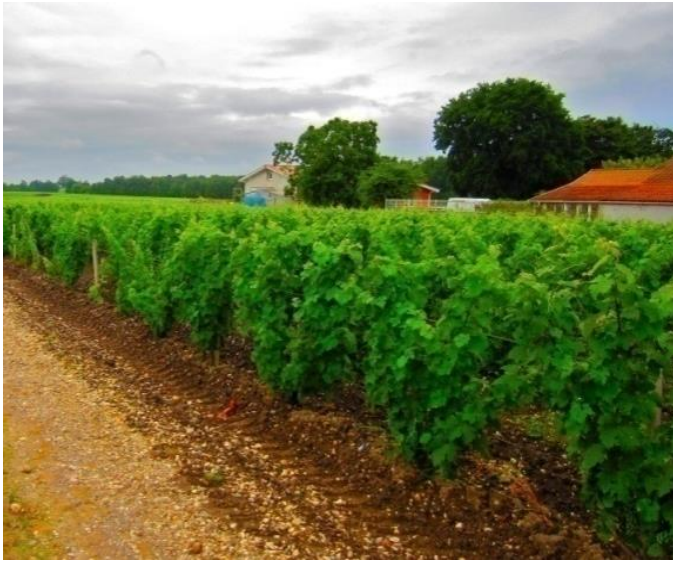
40+ year-old vines of Cabernet Sauvignon