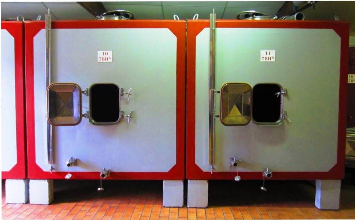
Christelle's choice for fermentation, cement